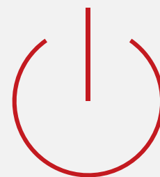
Local and regional energy operators

At Specialty MGA we take pride in delivering comprehensive Energy solutions tailored to diverse sectors