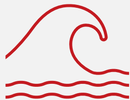
Offshore contractors and service providers