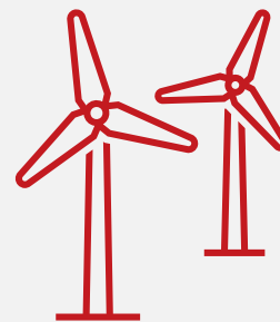
Renewable energy developers