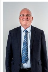
Dermot Dick Energy, Power and Renewables