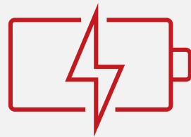
Energy storage and distribution companies