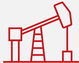
Global oil and gas conglomerates